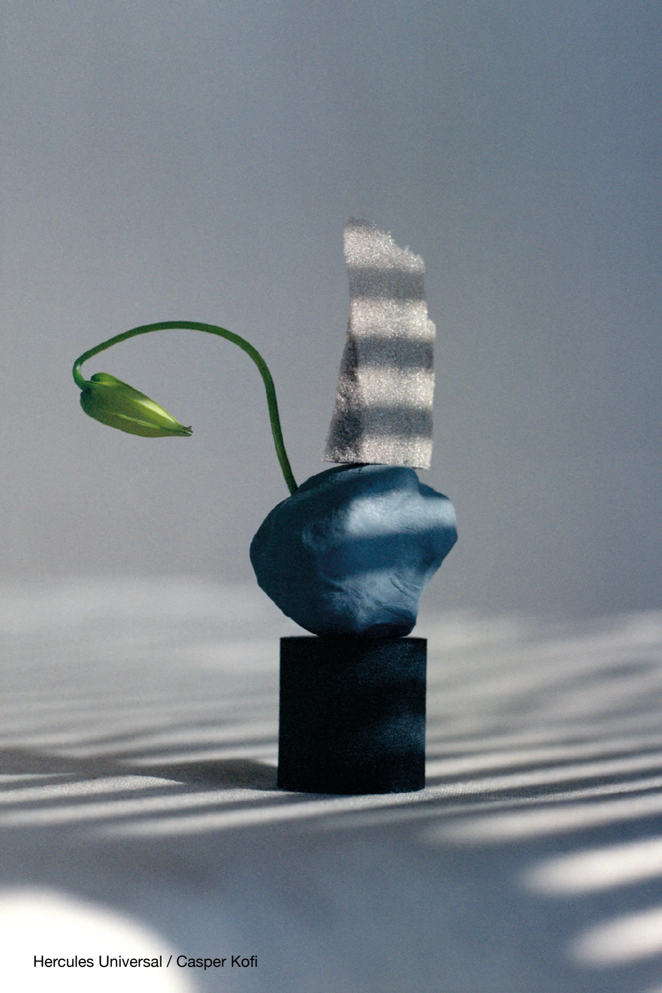
Hercules Universal / Casper Kofi