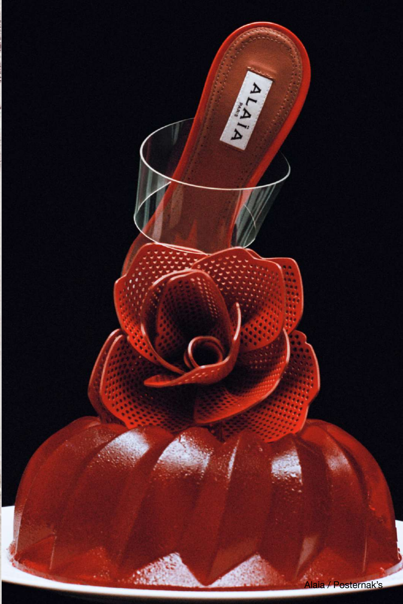
Alaia / Posternak's