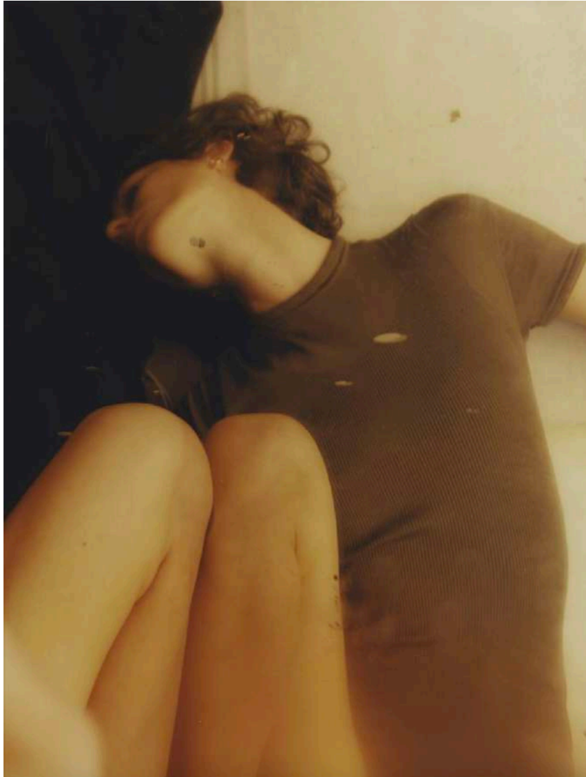
Le Monde d'Hermès / Sam Rock