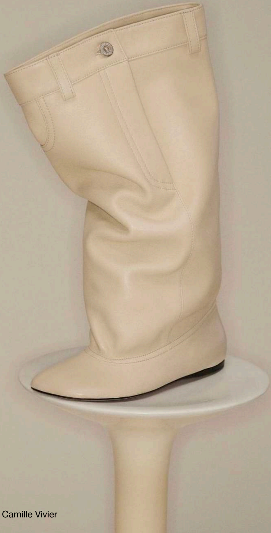
Loewe / Camille Vivier