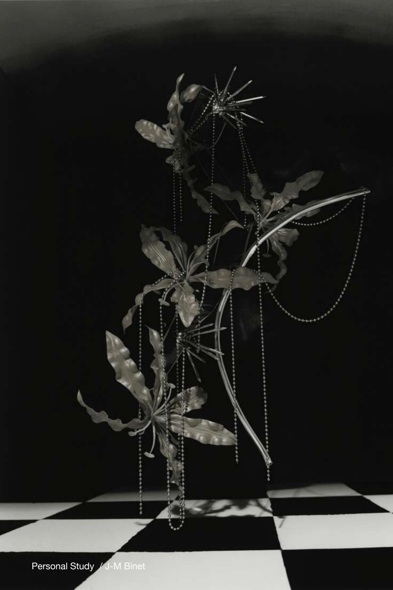
Personal Study / J-M Binet